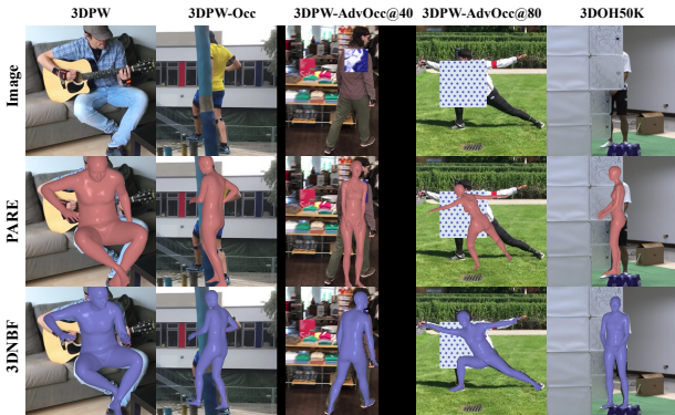
Figure 3: Qualitative results on evaluated datasets.